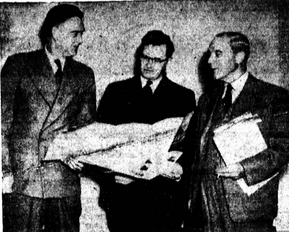
Premiers of three of the Maritime Provinces met recently at Moncton, N. B., to discuss economic and other problems. Left to right: Premier A. W. Matheson, Prince Edward Island; Premier Hugh John Flemming, New Brunswick, and Premier Angus L. MacDonald, Nova Scotia.