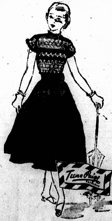
"Snowdrop" Wear this dress anywhere—it's always right! Silkspun, Bates combed yarn chambray, Sanforized to tub like a handkerchief. Fluted ruching trims neck and tiny semi-sleeves. Self-sash tops a pleated skirt. $9.95