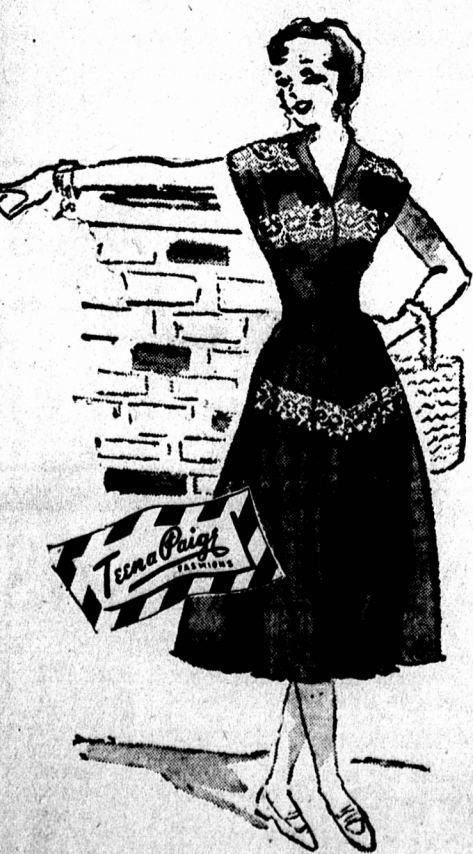
"Lace Princess" Val lace embroidery, charming and delicate as the tracery of dew, crosses your bodice and skirt. The perfect pastels seem airier, fresher — the Crown'n Water linen weave rayon stays fresh, guaranteed unconditionally washable. $9.95.