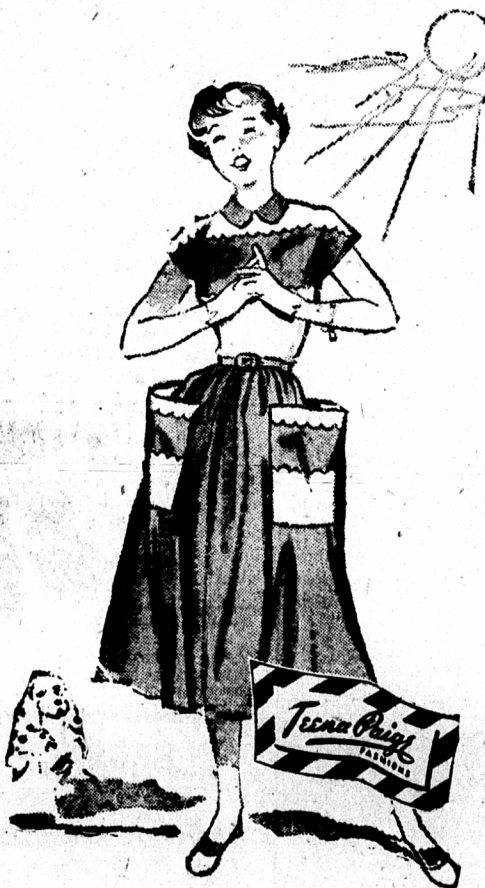
"Southern Charmer" —

AND you'll find "TEENA PAIGE" Dresses in "TEEN-CAMPUS" at Smallman's in 10 Beautiful, Popular Styles in fresh, guaranteed washable Cottons and Non-Tarnish Metallic Lumina — exactly as you've seen advertised in your favorite fashion magazine.