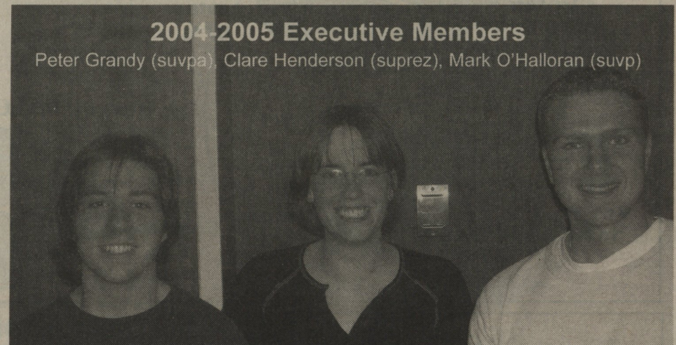
2004-2005 Executive Members