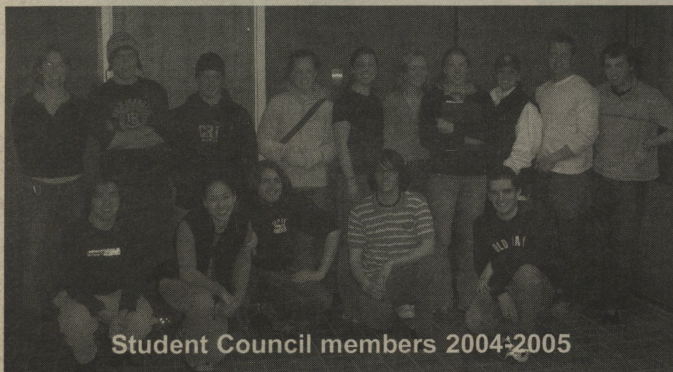
Student Council members 2004-2005