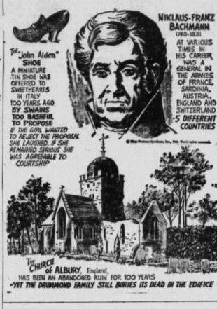
THE CHURCH OF ALBURY, England. HAS BEEN AN ABANDONED NUN STY FOR 100 YEARS. 'TIT THE ABANDONED NUN STY BURNS ITS DEAD IN THE EDIFICE