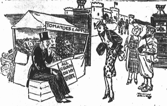
"I've got to do something to help pay the taxes on the estate." -Humorist.