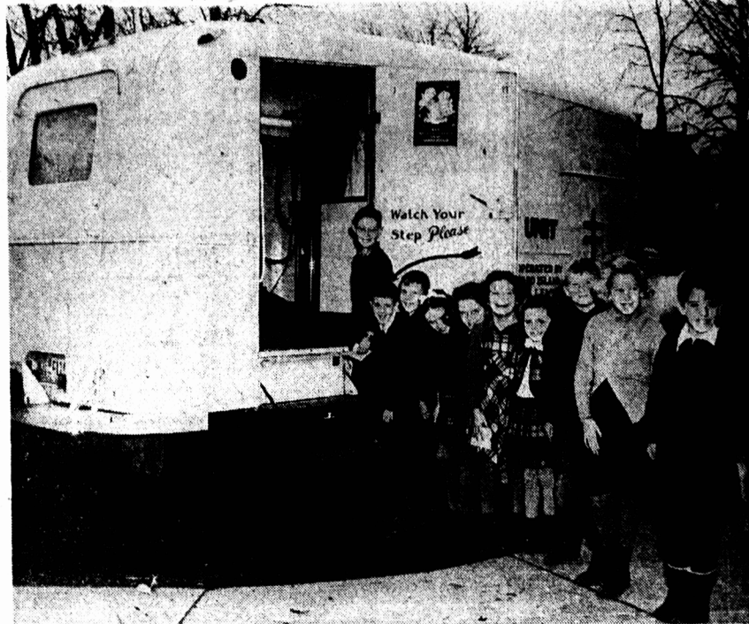
Pictured above are some of the children of Prince Street School receiving their free chest X-rays recently. This survey of the city schools is part of the T.B. preventive measures organized by the P.E.I. Tuberculosis League in co-operation with school principals.