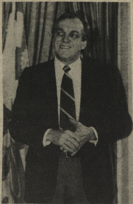
Everybody says they like me. Why won't they vote for me?

Ed Broadbent was the next one to visit Prince Edward Island when he held his rally at the Charlottetown Hotel. He and his four candidates for the Island (two Santa's, a comedian with an Island accent and a fourth) outlined the NDP platform when Broadbent finally did arrive. Broadbent emphasized in his speech that it was time for a "real change" in Canada's government. Mr. Broadbent "graciously" gave an interview to the same kids that called Clark earlier in the week after his rally was over in the ballroom. One