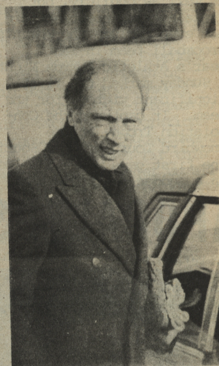
Everything is under control, boys, everything is under control.

in taxes. Also, while commenting on the 18 cent gasoline excise tax, he said we would need 71,000 dollars extra to run the hospital because of this senseless tax to pay for Clark's election promise for a mortgage deductibility program.