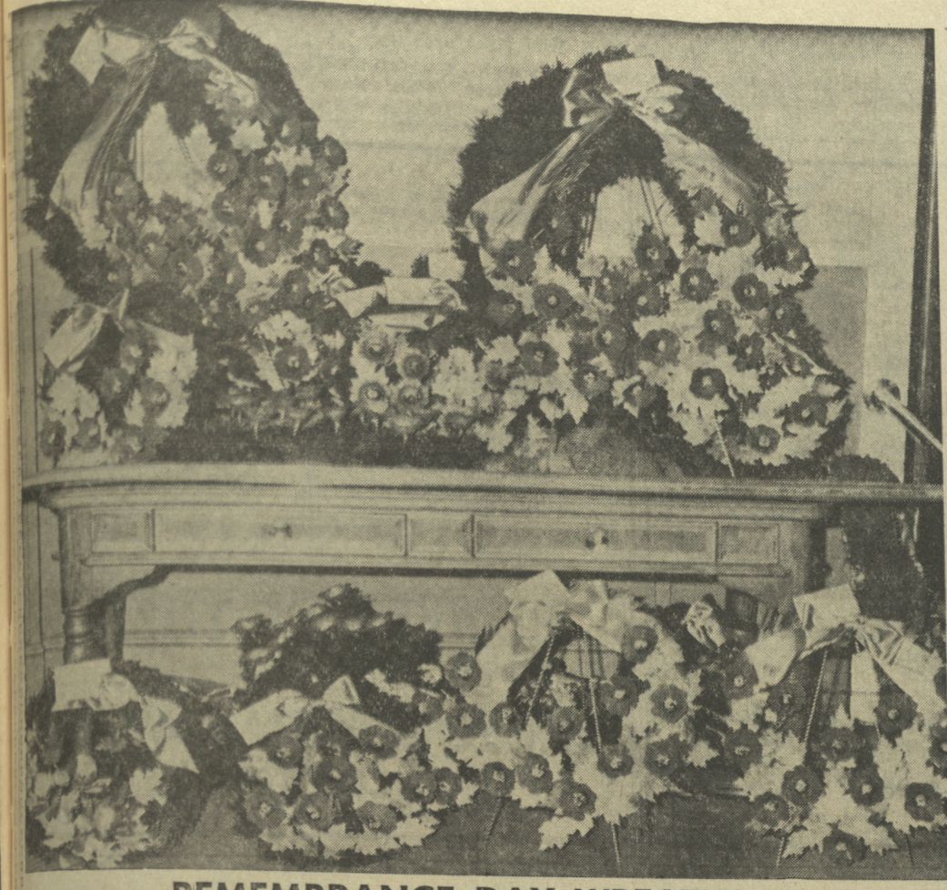
REMEMBRANCE DAY WREATHS

Wreaths that are among many will be placed at the Cenotaph in Memorial Square today in