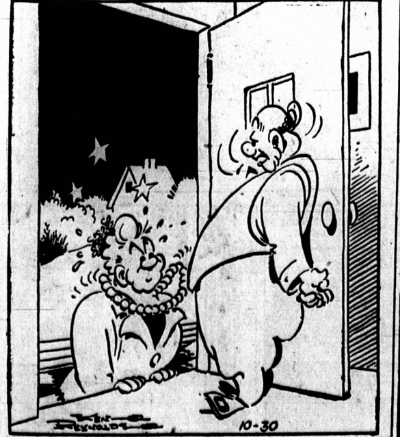
"Okay! Okay! I'll look in the Guardian Want Ads for someone to fix the porch—but you gotta stop eating so many strawberry sundaes!"