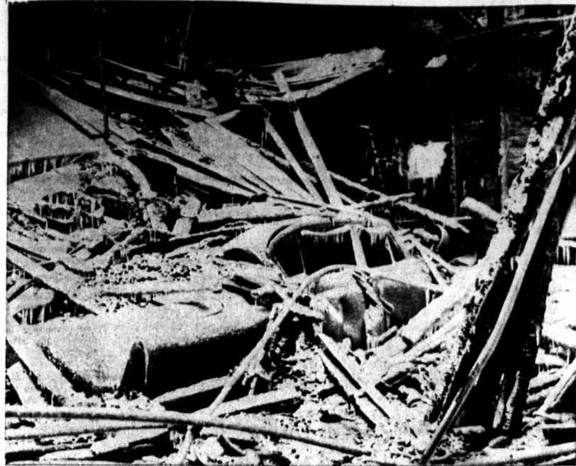
SOME WRECKAGE AFTER MONDAY'S FIRE