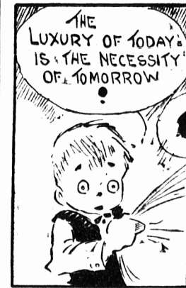
THE LUXURY OF TODAY IS THE NECESSITY OF TOMORROW