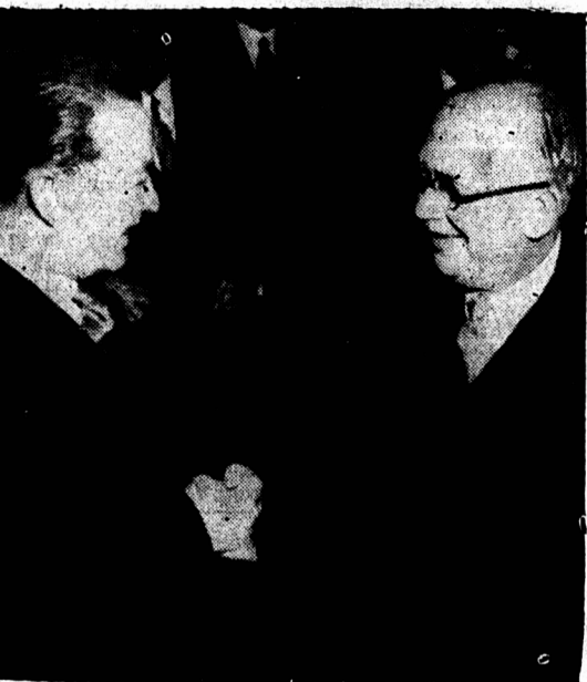
President Auriol being greeted by Governor-General Viscount Alexander as he arrived in Ottawa.