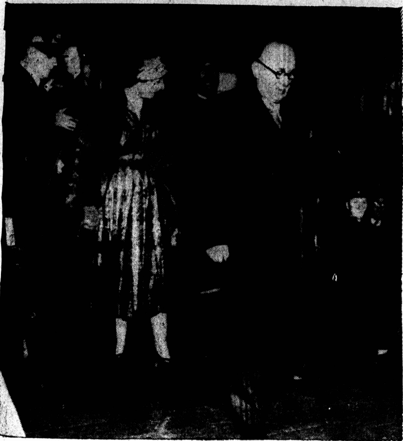
President and Mde. Auriol and party arrive by special train in Ottawa.