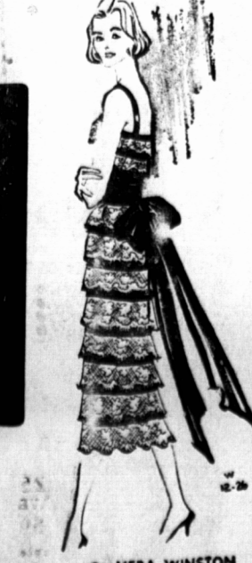
By VERA WINSTON

For all its slim sophistication this dress has a softly sweet feminine look. Tiers of lace form the frock from the camisole top all the way down to the hem the tiers are separated effectively by bands of black taffeta. Black taffeta is used for the midriff finished in back with a huge bow and streamers. The shoulder straps of the squared off neckline are of the black silk too. A good number at home or at a southern resort.