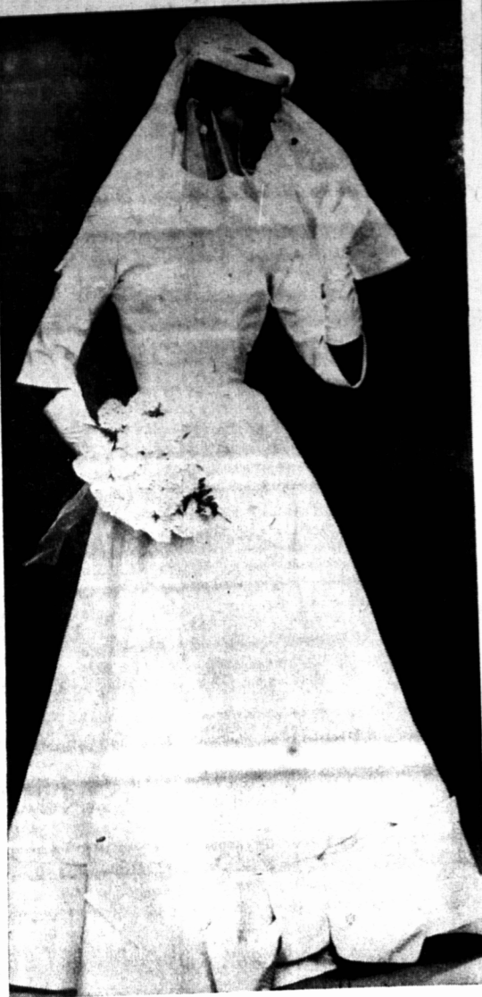
FOR WINTER BRIDE