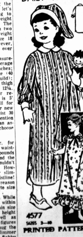
4577 SIZES 2-10 PRINTED PATTERN

Night-night. Our new Printed Pattern makes a bedtime wardrobe that's easy to sew, fun to wear. Sleep-cap is gay topping for the tailored gown. Frilly ruffle version if she loves a "glamour" look.