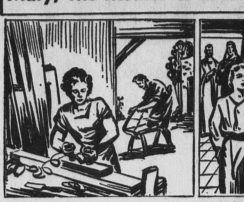
Like many parents, Mary didn't fully understand her Son. But she kept questioning Him a great deal during normal childhood.—Luke 2:19, 40; Matthew 13:55-56.