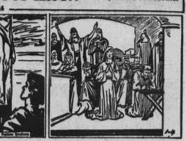
Throughout His life, Jesus was deeply concerned for His mother. From the Cross, He selects His "disciple" John, to replace Himself as her son.—John 19:27.

MEMORY VERSE:—"And Mary said, 'My soul doth magnify the Lord and my spirit hath rejoiced in God my Saviour.'" Luke 1:46-47.