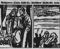
At the temple, Jesus sits with the teachers, to learn, to ask and answer questions. When found; He is surprised His parents didn't know where to look for Him.—Luke 2:42-52.