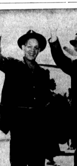
Four victims of the crash of a Maritime Central Airways plane near Quebec wave happily.