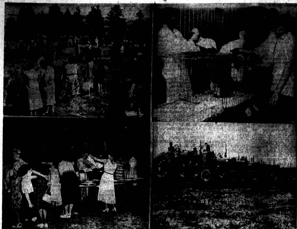
(Top Left) 264 cattle passed through the cattle judging ring at the Crapaud Exhibition. Judging which began at 11 a.m. was not concluded until late afternoon. A sound system enabled the announcer to keep the spectators informed on the various classes and the judging results. (Top right) This photo shows judging in progress at the Poultry Section of the Crapaud Exhibition, where two ducks are seen looking their prettiest for the judges. (Center left) Throughout the day the various indoor exhibits at the Crapaud Exhibition continued to be a special point of interest as most of the two to three thousand persons took time out to visit this remarkable part of the exhibition. Some of the ladies are seen scanning the exhibits in one section of the rink that was used in connection with this part of the show. (Center right) While many excellent horses were shown on Wednesday at the Crapaud Exhibition, the tractors also had their own competitions, and some of them are seen in line before the beginning of the tractor races. (Bottom left) The large Hereford bull was one of the championship winners in the Hereford division at Crapaud on Wednesday.