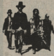
Rage Against the Machine The Battle of Los Angeles (9) Epic

From the band that brought you "x and Candy" comes some more of the same old offside lyrics and occasional straight-up rock tunes. Even with several boring, meaningless, overwrought slow songs, this album is still well worth a listen. Plus it has a kick-ass album cover to boot. Cool!