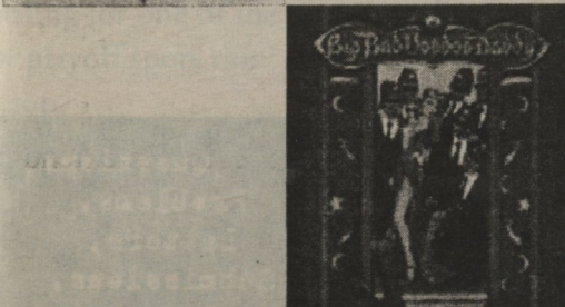
Big Bad Voodoo Daddy This Beautiful Life (6) Universal

This is one sweet album. Poetic songwriting, eclectic styles, and of course, more examples of Ben Harper's amazing talent with 6 and 12-string guitars. The songs can be fragile and emotional, or strong and heavy, but they all stick together well with great melodies, mini-soundscapes, Harper's great voice and lyrics, and... it's just good, OK? Take my word for it.