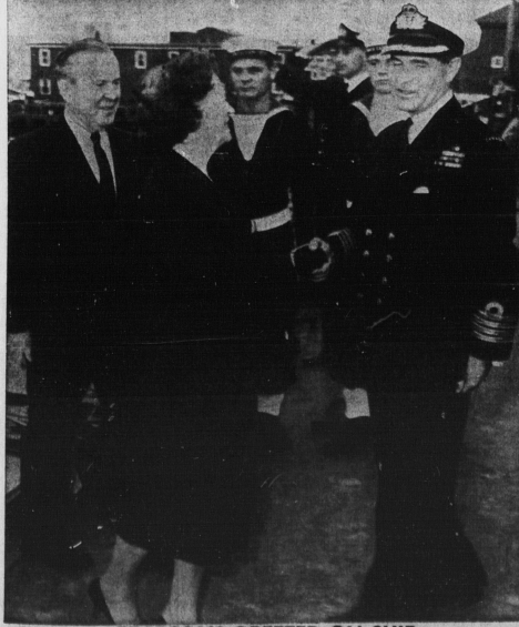
PEARSONS GREETED ON SHIP

Prizes having been donated by our manufacturers, they must be accepted without exchange privileges. We reserve the right to decide on any exchange such as in the case of sizes.