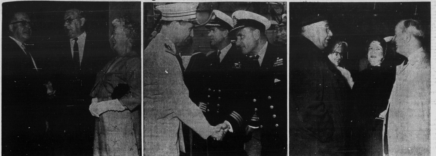
SASKATCHEWAN'S Premier Ross Thatcher, left, was greeted by Premier Walter Shaw on his arrival last evening at Montgomery Hall where the provincial government tendered a buffet luncheon for