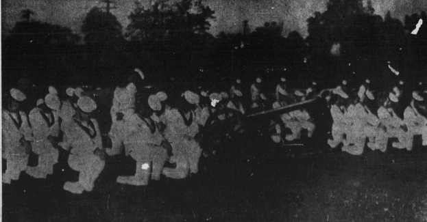
HEADS BOWED as the band plays the evening hymn, snare drum from HMCS Cornwallis adds a touch of ceremonial solemnity to the proceedings at Memorial Field last night. With perfect timing and precision the white-uniformed sailors drew the gun carriage, loaded and fired the ceremonial salute, setting the mood and provided the background for the commemorative Sunset Ceremony.