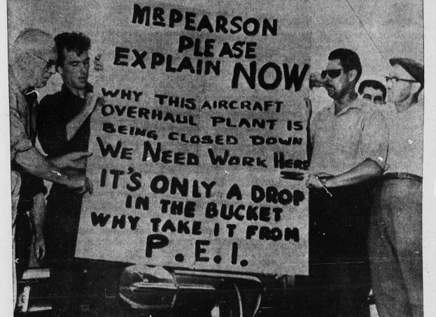
MEMBERS OF Local 1937 of the International Association of Machinists display placards with which they greeted Prime Minister Pearson on his arrival at Charlottetown yesterday. They were protesting the scheduled closing of the aircraft repair plant, Enamel and Heating Company Limited.