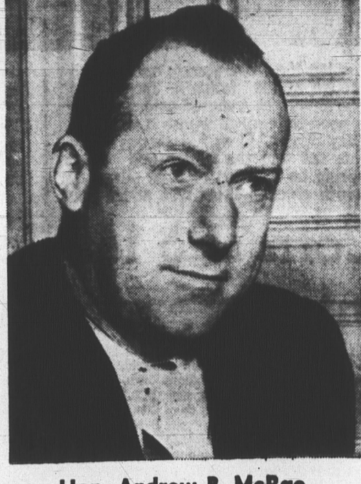
Hon. Andrew B. McRae Minister of Agriculture