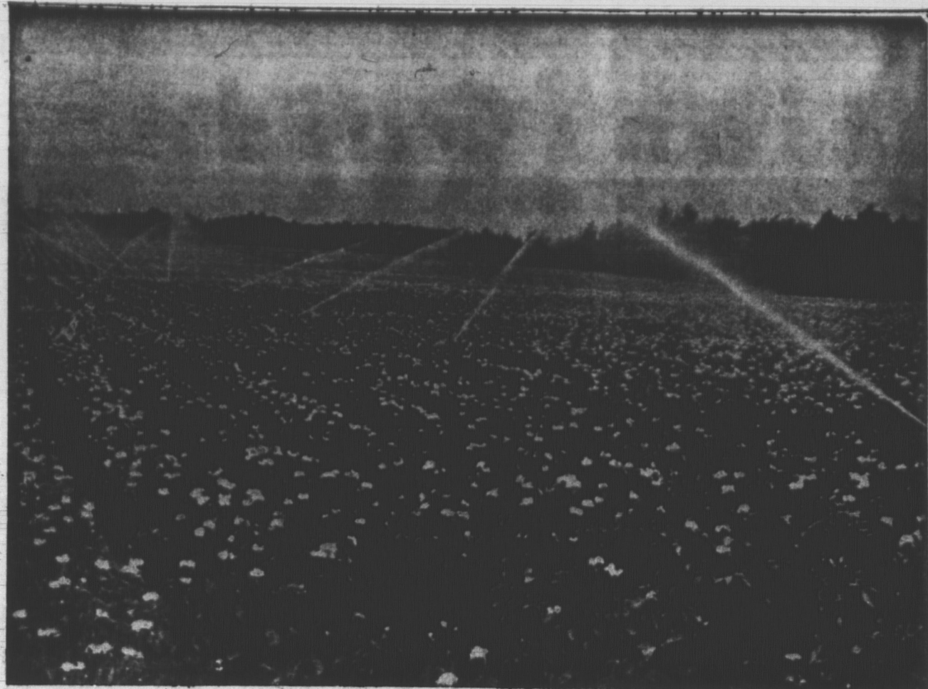
IRRIGATION HAS GREATLY BENEFITTED POTATO GROWERS