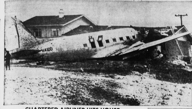
CHARTERED AIRLINER HITS HOUSE