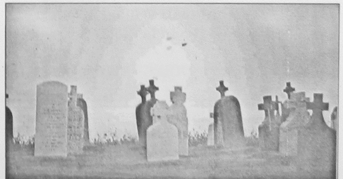
The Saint-Philippe-et-Saint-Jacques Cemetery (Baie-Egmont), an example of a parish cemetery where one finds much precious information for genealogical research.