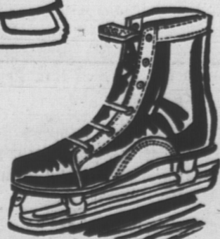
FIGURE SKATING OUTFITS

Boys' sizes 1 to 5 8.88 Youth's sizes 10 to 13 7.88 Men's sizes 6 to 12 8.97