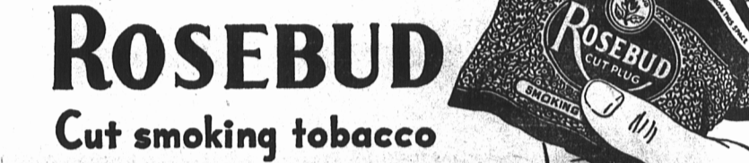
Chart your course to fuller smoking pleasure with a tobacco that's cooler, richer, smoother tobacco that makes any pipe a better pipe — good old Rosebud! More and more smokers are "coming about" to Rosebud because it's a better tobacco, and always a shipshape smoke in the handy seal-tight pouch.

Get under Sail with a pipeful of ROSEBUD!