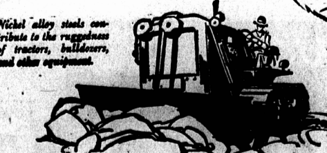
Steam shovels and other earth-moving and construction equipment contain many parts made of strong, tough, durable nickel steels and nickel cast irons.