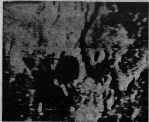
THESE HISTORIC first shots of the Moon's surface were taken by television cameras in the Ranger space capsule that scored an impressive direct hit on the lunar surface. These pictures are the first the world has ever seen. They indicate the surface of the Moon is not a smooth plain pocked with hundreds of small craters. Clustering of craters, invisible to earth telescopes, indicates they were caused by rocks thrown from the larger crater of Copernicus 200 miles north of the Sea of Clouds, where Ranger hit within 10 miles of its target. The above shot was taken from an altitude of three miles, 2.3 seconds before the Ranger capsule crashed.