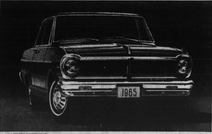
Acadian Inva-car 2-Door Sedan