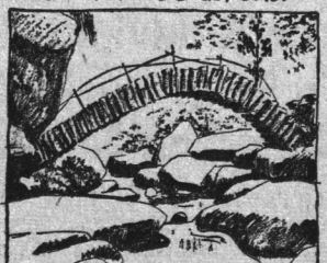
AN ARCHED BRIDGE in the Calnegga Valley, Switzerland HAS BEEN STANDING FOR CENTURIES ALTHOUGH ITS STONES WERE PUT IN PLACE WITHOUT THE USE OF MORTAR