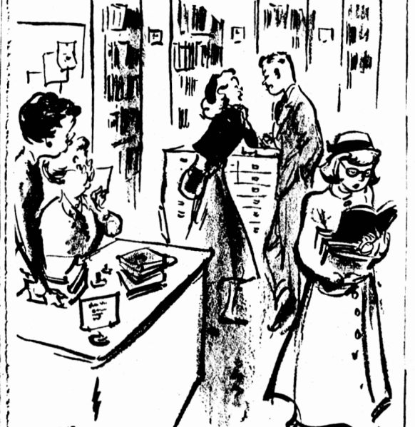
"Some girls come here just for books, others to meet their boy friends. I wonder which are the most intelligent."