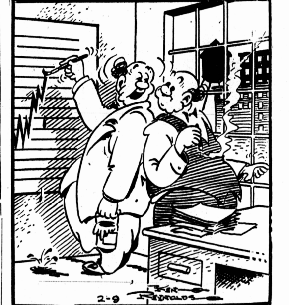
"Our Guardian Want Ad results make me shudder when I think of the taxes we must pay!"