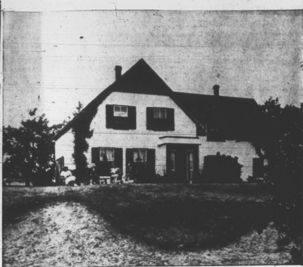
Immortal "Anne of Green Gables" Cavendish, P.E.I.

Prices: Evenings $1.50 to $3.00 Matinees $1.00 to $2.50 Two Box Offices Open Daily: Summerside—Linkletter Travel Agency; Open Weekdays 9 a.m. to 12 Noon; 1 p.m. to 5 p.m.; Fridays to 9 p.m.; Saturdays 9 a.m. to 12 Noon. Confederation Centre—Open Daily 10 a.m. to 9:30 p.m.; Sundays 1:00 p.m. to 4:00 p.m.; 7:00 to 9:00 p.m.