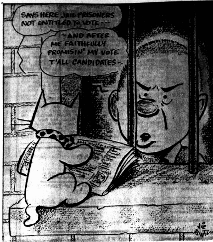
CALL THAT JUSTICE?

A spokesman for the American Iron and Steel Institute says that the new highway system now being built across the nation will enable motorists to drive from coast to coast without spotting a red light and to save a cent a mile in fuel and operating costs.