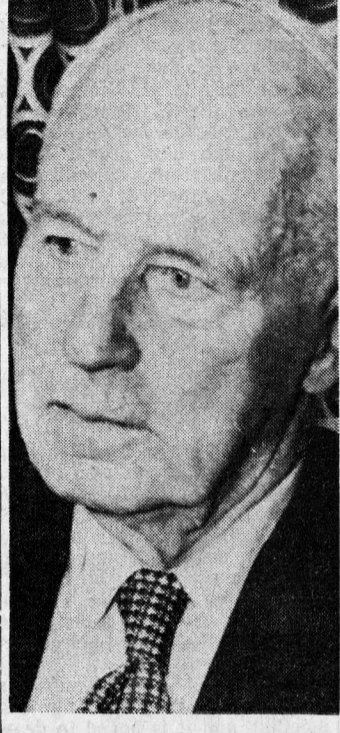
RT. HON. MR. MEIGHEN

Service charges on the public debt - second - largest item of spending - were $57,100,000, compared with $34,100,000 in 1956-57.