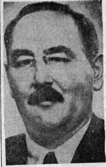
THE LATE MR. NAGY

LONDON (Reuters) - Former Hungarian prime minister Imre Nagy has been executed for his role in the anti-Soviet revolution in his homeland.