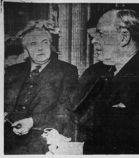
BRITISH, CANADIAN PMS CONFERENCE Prime Minister Pearson (right) talks with British Prime Minister Harold Wilson in Mr. Pearson's office on Wednesday. The two men were expected to discuss means of strengthening the Atlantic community, bilateral relations and Commonwealth affairs.

that Canada would most feel the impact on world commodity markets of general disarmament," the report concludes.