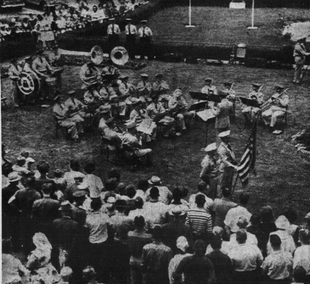
(4) BANGOR BAND PROVED BIG HIT AT AFTERNOON CONCERT