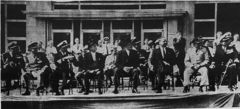
(1) BEST SEATS IN THE HOUSE FOR THE SHOW OCCUPIED BY VISITING AND LOCAL DIGNITARIES

Last year's Gold Cup and Saucer Parade and other activities during Gold Cup Day constituted a memorable event. Held under clear skies with the sun shining brightly, the parade was seen by an estimated 22,000 spectators who lined blocks off block along the parade route.