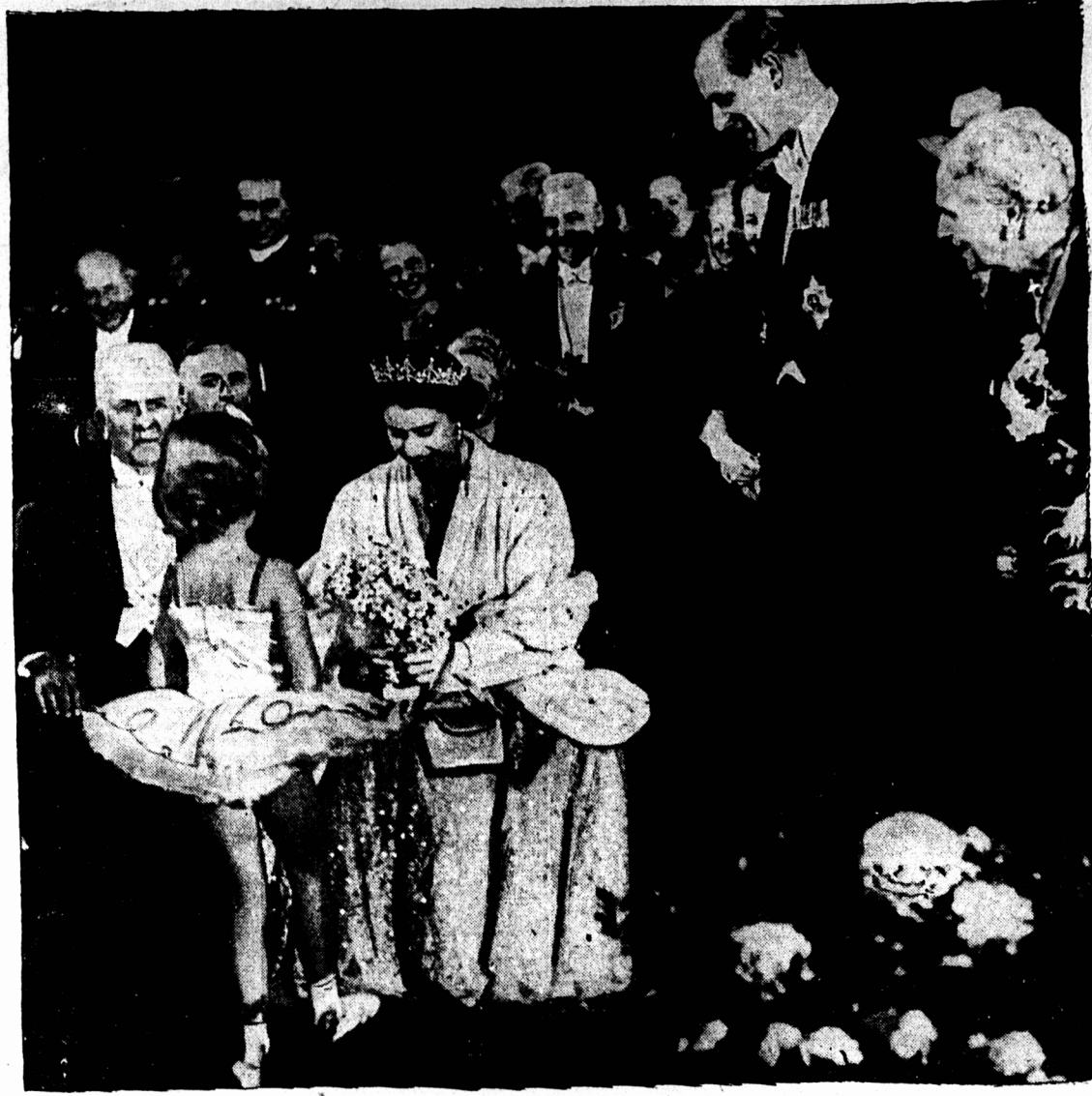
AT BALLET, PETITE MISS PRESENTS PRINCESS WITH BOUQUET WHILE PHILIP LOOKS ON

A follow-up study showed 25 recovered, 30 drinking but managing better, 21 still drinking but improved.