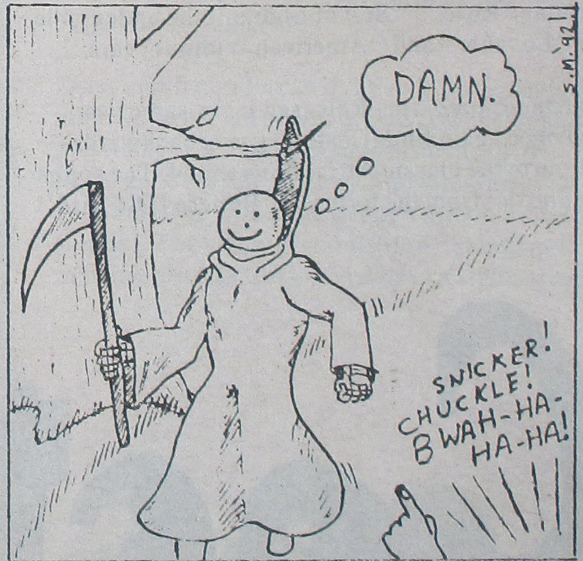
WHY THE GRIM REAPER WEARS A HOOD.