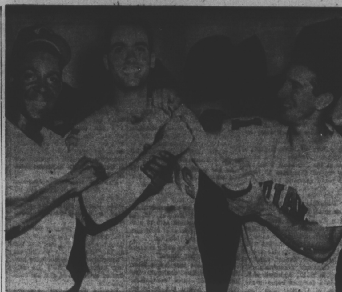
MUSCLE POWER Minnie Minoos (left) and Billy Martin (right) playfully feel Rocky Colavito's muscles after the Big Cleveland Indians' outfielder hit four home runs in one game against Baltimore Orioles last week. Rocky was the eighth player in major league history to perform the feat.