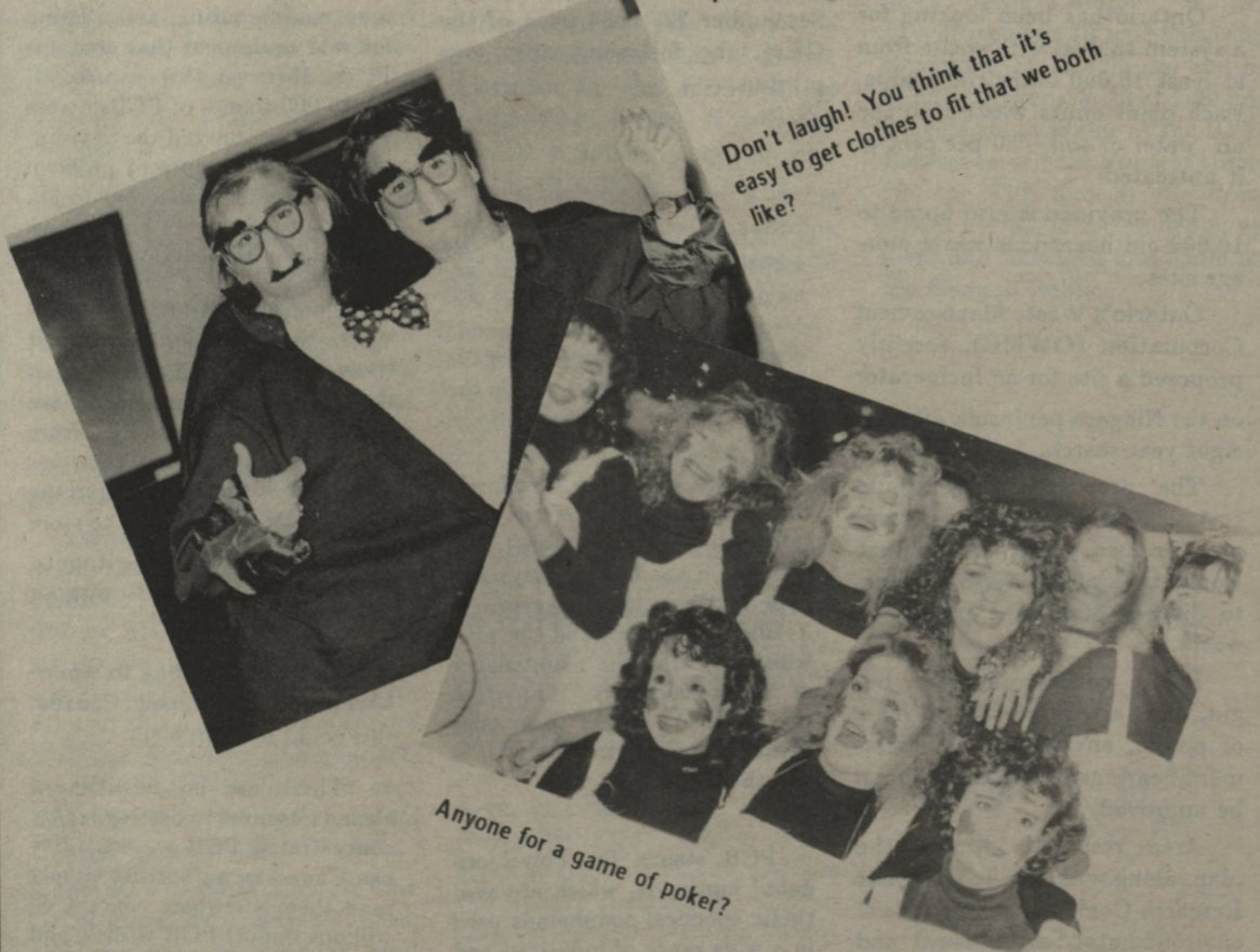
Don't laugh! You think that it's easy to get clothes to fit that we both like?