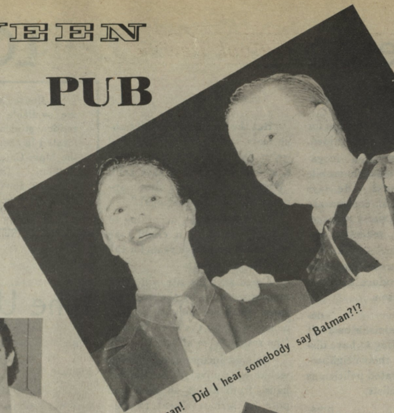
Batman! Did I hear somebody say Batman?!!

Recognize any of these strange and terrifying creatures? They are just some of the participants in last week's Halloween Pub, held at the Panther Lounge on Saturday, October 28. Fun was had by all, and almost everyone came in costume. Featured here are only some of the best, but there were many, many more.