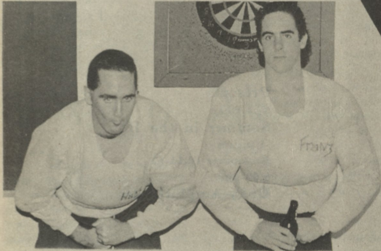
Hanz und Franz: we're here to pump you up with our new beer-enriched diet!