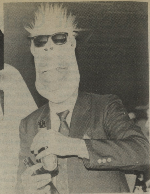
Could this be the new Alpine Lite rep?