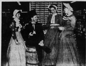
These pictures are just a sample of what you will see at our store this week.

Sale Dates February 12th-13th-14th-15th . . . Open Thur.-Friday and Saturday Nights