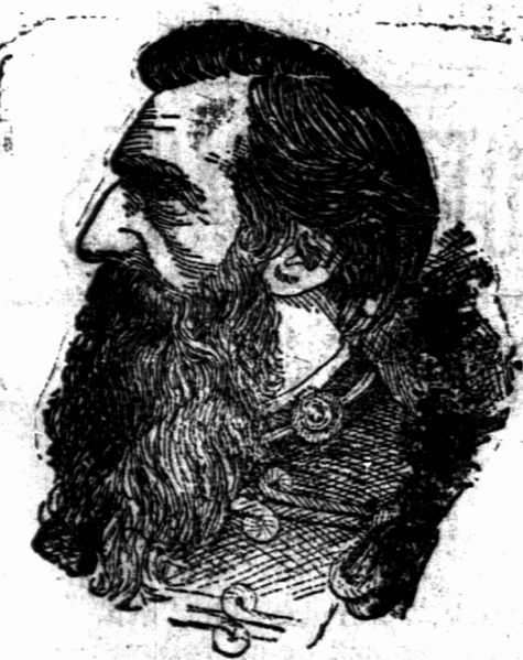
Now in Philadelphia.