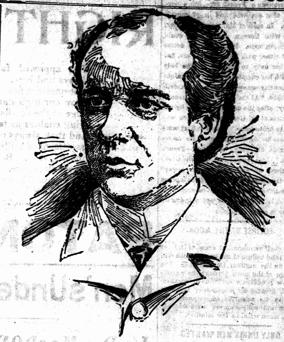
HON. WILFRID LAURIER Who is now on the way home from England.