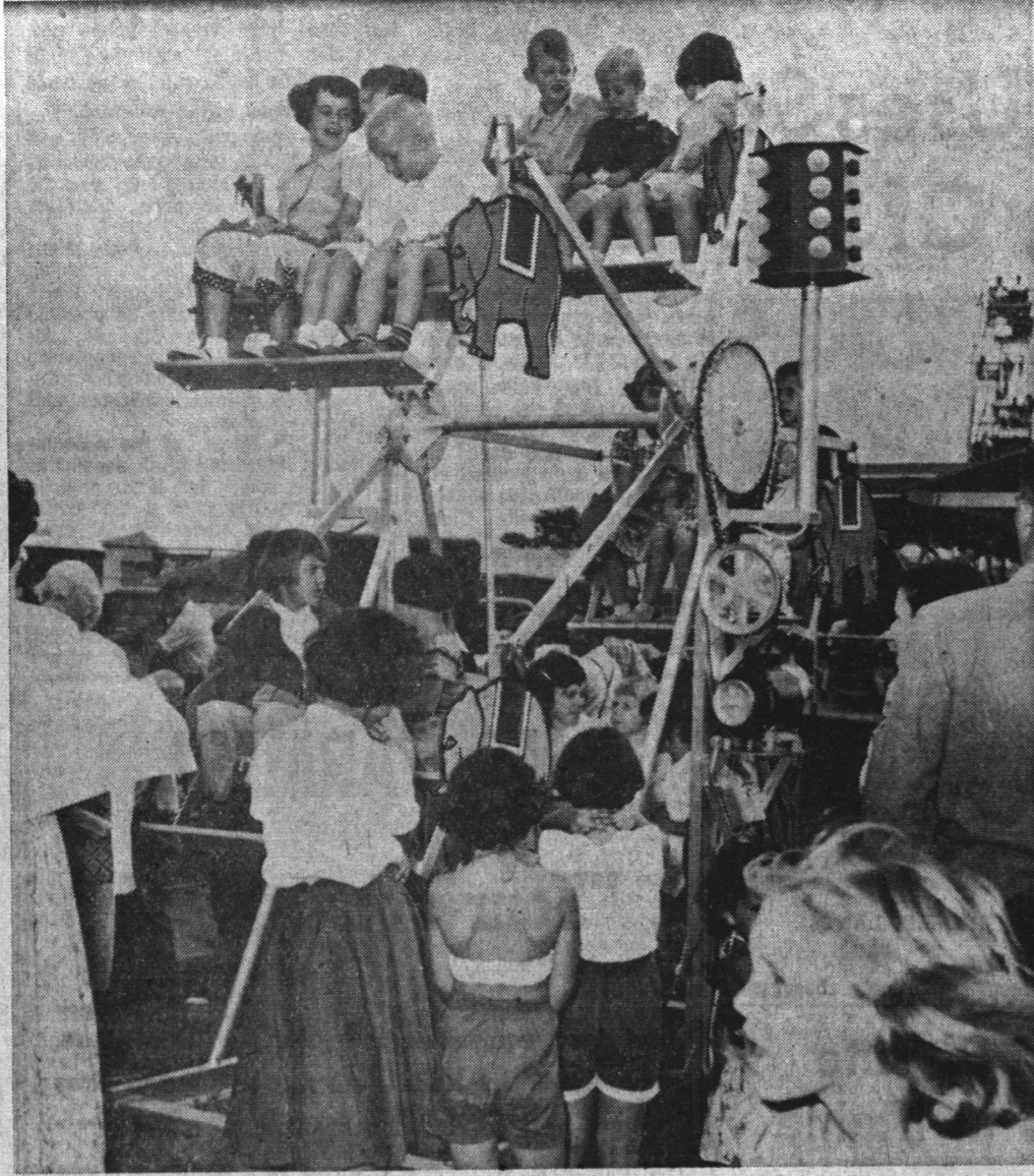
OH TO BE YOUNG AGAIN