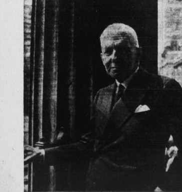
Hon. Vincent Massey

PLEASE NOTE: The privilege of hearing both noted speakers will be limited to members only. The public is cordially invited to join today!