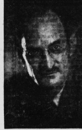
NOVEMBER 13 WILLSON WOODSIE

TOPIC: "New Frontiers in Canada's Northern Economy".