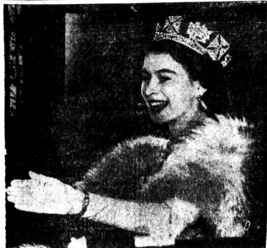
The entire Coronation of Queen Elizabeth is now brought to the screen in J. Arthur Rank's Technicolor Presentation "A Queen Is Crowned," a full length feature released by Universal-International. This marks the first time that a British Coronation has ever been photographed in Technicolor. Lawrence Olivier, British actor, narrates "A Queen Is Crowned."