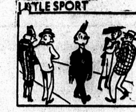
IN THE CORNER