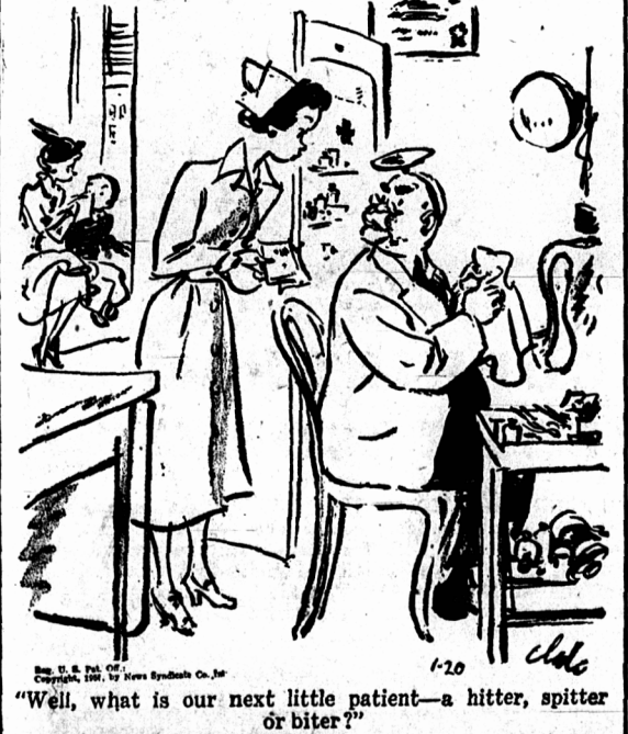
"Well, what is our next little patient—a hitter, spitter or biter?"