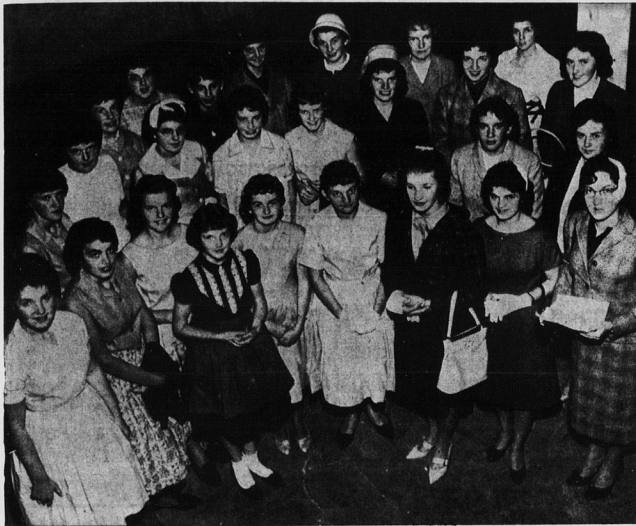
GARMENT CLUB MEMBERS ARE PROUD OF THEIR HOMEMADE CLOTHES