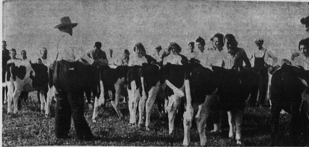
CALF CLUB MEMBERS SHOW LIVESTOCK OF TOP QUALITY