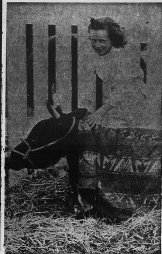
A HAPPY WINNER