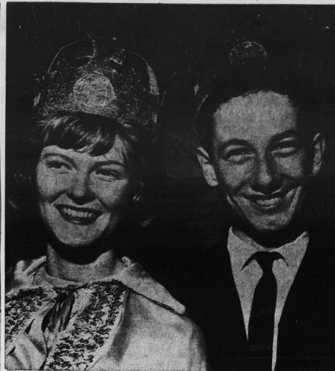
ALL HAIL TO THE KING AND QUEEN