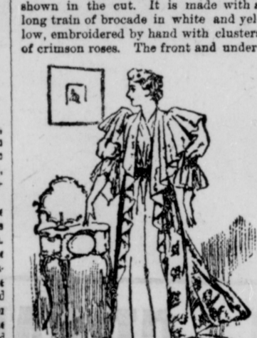
A THING OF LACE AND BROCADE.

Princess Marie's Tea Gown. One of the prettiest tea gowns of Princess Marie of Edinburgh's trousseau is shown in the cut. It is made with a long train of brocade in white and yellow, embroidered by hand with clusters of crimson roses. The front and under-