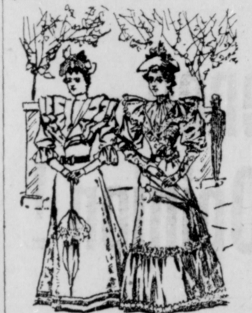
PRETTY PARIS GOWN.

Old Fashioned Frocks More Used Than Ever This Season. The cut shows a graceful Paris gown, in the present fashion, of lilac crepon ornamented on the edge of the skirt with bias bands of pany satin.