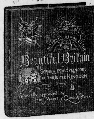
Large quarto volume (13 1/2 x 13 1/2 ins.), 385 pages. Extra enameled paper. Extra English cloth, emblematic embossing in ink and gold.