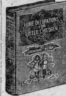
16mo, 144 pages; bound in linen, gilt top.

Hundreds of Hints on How to Make the Little Folks Happy Lists of Stories, Songs and Plays Invaluable to Mothers and Nurses