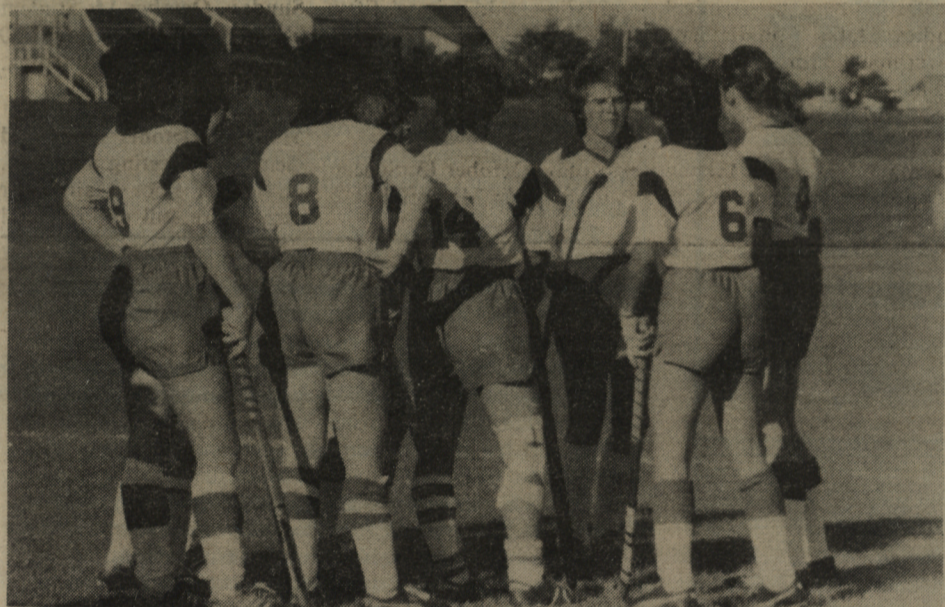
Panthers field hockey team gather on the field for a conference.